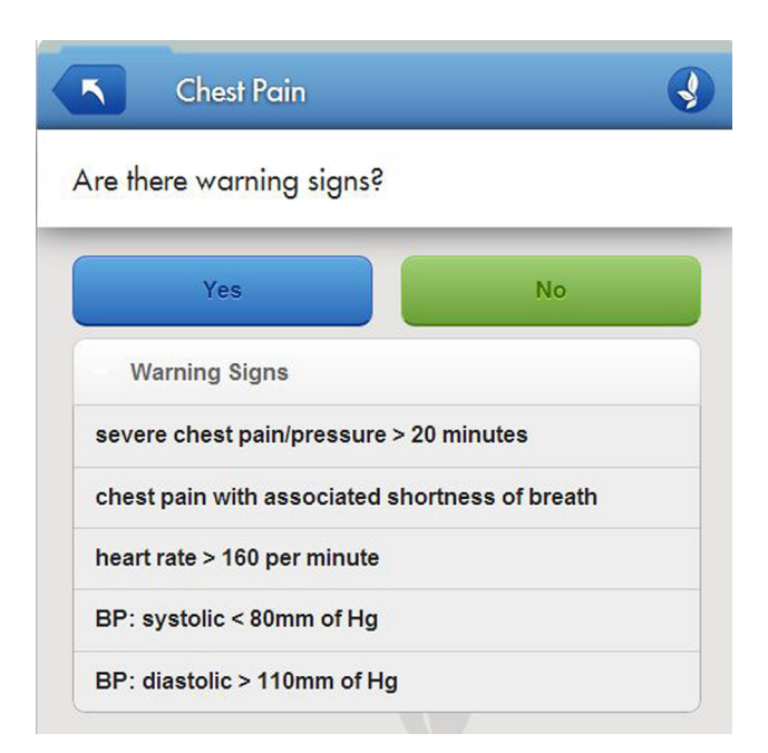
Fig. 2 - Screenshot of warning signs.